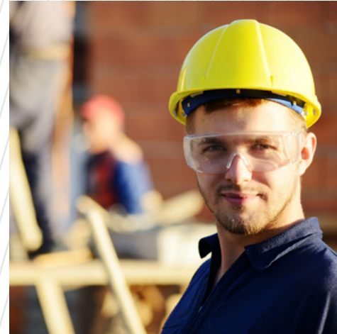
CERTIFICATE IN HEALTH, SAFETY & ENVIRONMENTAL PROCESSES (Full-time | Part-time)

After GPC: Work in banking, human resources, investment or real estate. You may continue your education and complete a Business diploma at Saskatchewan Polytechnic or apply credits to degrees such as business management and chartered accounting at one of several universities.