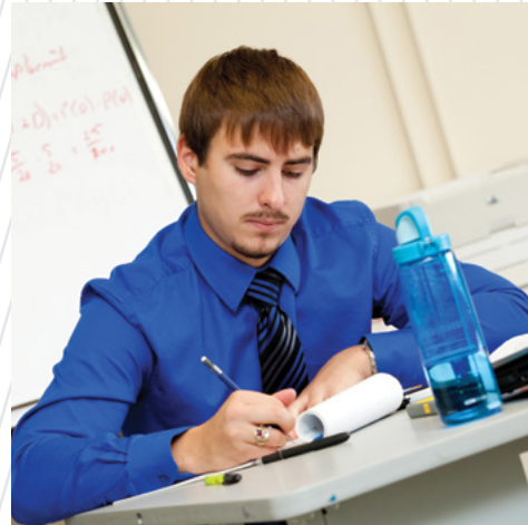
BUSINESS (Full-time | Part-time)

After GPC: Work as a general office clerk, administrative assistant, or a data entry officer.